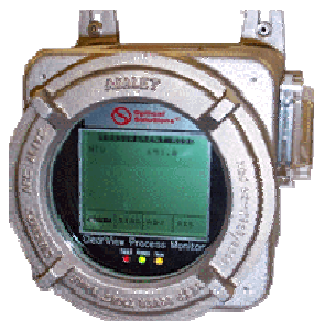
ClearView™ in Class 1, Div 1 (EEx/d IIB) Enclosure

It is good practice to maintain absorbance's below about 1.2 AU. The high background absorbance from EG due to its OH content restricts the optical path length of the fiber optic probe to < 3mm. Practical experience warns against using narrow optical paths to avoid entraining particles, or especially bubbles, and for ease of cleaning. 2 mm is as small as we are comfortable recommending for process analysis. ClearView™ was designed for the visible-NIR range up to 1650 nm. Therefore, it is suitable for the 1488 nm measurement. If extra precision is required, our top-of-the-line ChemView® photometer is the proper choice for use at the more sensitive wavelength at 1944 nm (±0.01 %). Furthermore, if only the ppm range is of interest, we can provide a longer (e.g. 5 mm) probe at 1944 nm with our ChemView® having precision of about ±50 ppm in the 0 to 3000 ppm range.