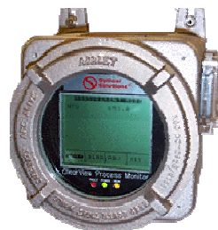
ClearView™ in Class 1, Div 1 (Ex/d IIB) Enclosure

These results show that a NIR ClearView™ can match the typical 1% FS performance of a process GC at about 2/3 the price with lower maintenance costs. Compared to a GC, ClearView's 0.2 s data update is virtually continuous. With its small size (8" cube), its installation costs are 1/5 of typical GC installation costs and due to its no-moving parts design, the only maintenance required is changing the lamp every 4-6 months, and perhaps re-zeroing once a month.