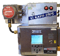
ChemView in Class 1, Div 1 (EEx/d IIB) Enclosure