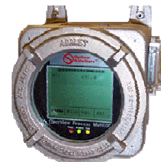
ClearView in Class 1, Div 1 (EEx/d IIB) Enclosure