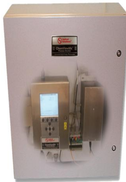
ChemViewMX 4, 6 or 8 Sample Points

As shown in the picture and schematic, the 36 x 36 x 12" enclosure can be purged and temperature controlled for best ChemView performance. The software within ChemViewMx is identical to that in ChemView, except you will see "Probe 1", "Probe 2", etc depending upon which sample point is being analyzed.