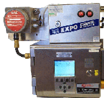
ChemView® in Class 1, Div 1 X-Purged Enclosure