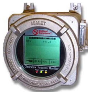
ClearView™ Class 1, Div 1