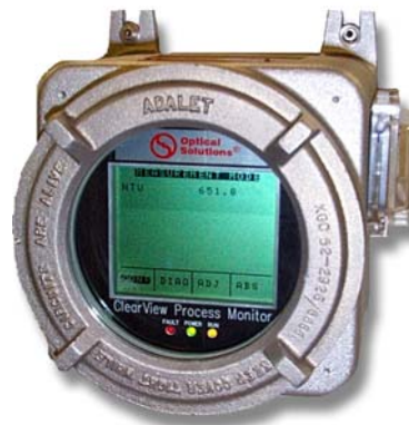
For North America Class 1, Div. 2 Groups B-D

The picture bottom right is of an insertion probe contained in a safe retraction device measuring fuel color in France.