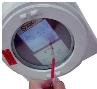
For Europe EEx d II T6